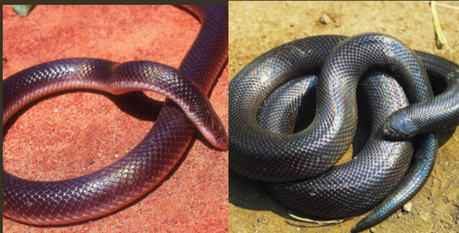
Bibron's burrow. asp Small-scaled burrow. asp